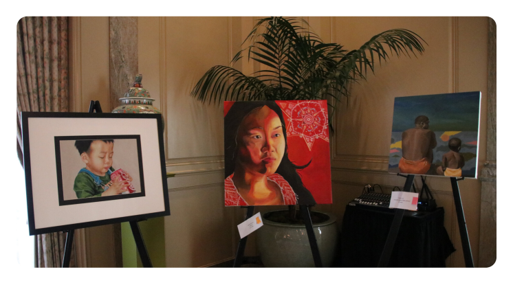
Talented students displayed their artwork for consideration as finalists for the Pageant of hte Arts.