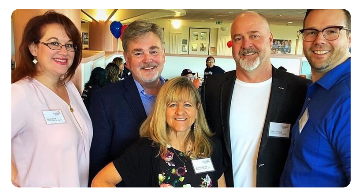
Part of the crew that helped with National Adoption Day at the Children's Court