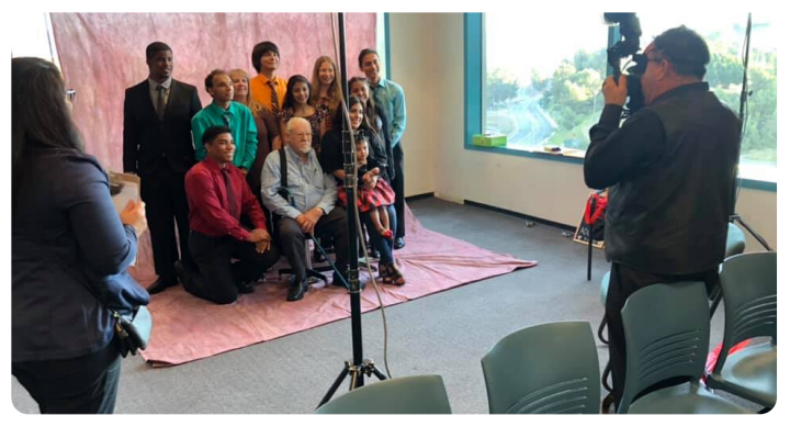
Capturing the first family photos for the newly established families was meaningful and rewarding!