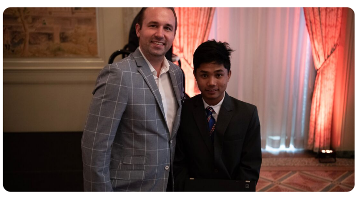
The Myanmar Water Project Committee continued their good work by partnering with organization HiTech who donated laptops to Myanmar recipients.