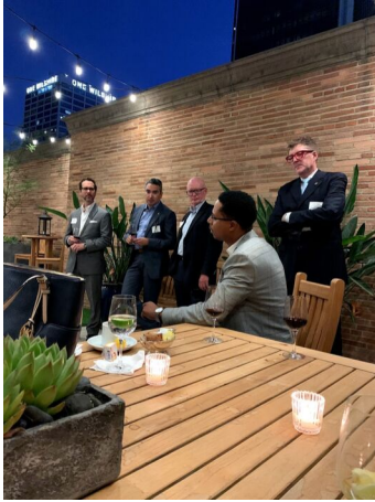
MEN CAN BE FEMINISTS TOO! LA5 JOINS IN ON 2-2 TUESDAYS ON THE TOPIC OF GENDER PARITY

LUNCH MEETING, 2-2 TUESDAYS ... AND THE FACEBOOK TROLL STRIKES AGAIN!