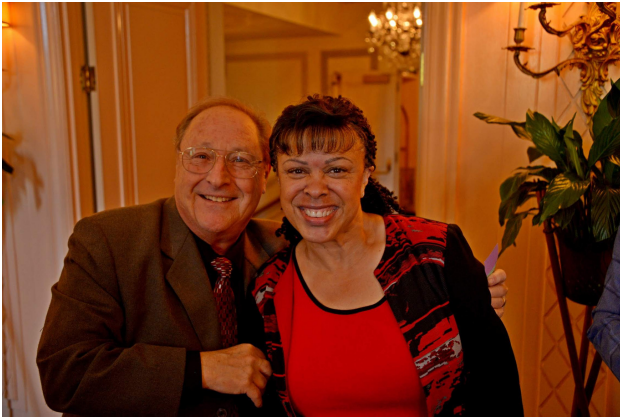
The room was shining from the presence of so many superstars ...