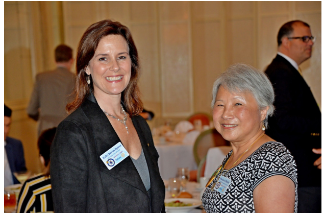
... from the Club and the District!