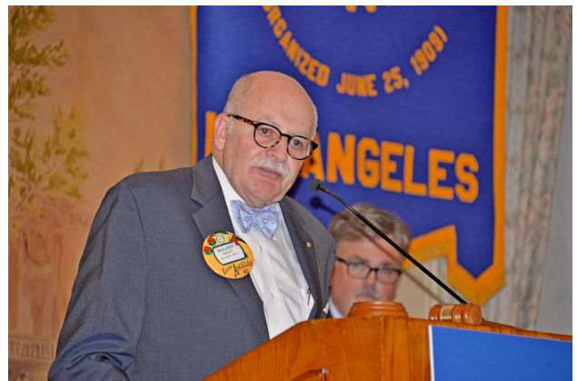
Walker moved the club with a heartwarming message about Rotary International and how it truly connects the world.